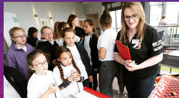
Coordinating an F1® in Schools Event

"My main piece of F1® in Schools advice would just be to give it a go! It genuinely doesn't matter if you win or lose, the competition taught me such a wide range of skills - from designing, making, and racing the car to creating a business presentation, and raising money through gaining outside-of-school sponsorship. I had such a great time, and it was truly an eye-opener as to what I wanted to do as a future career."