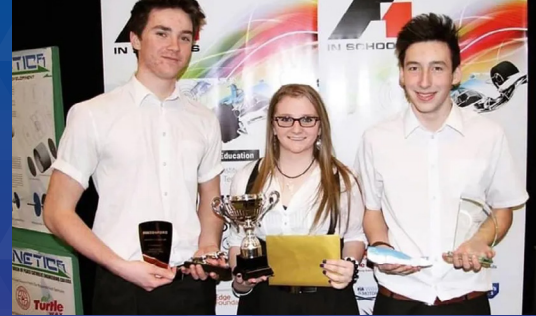
National Finals 2014

"F1® in Schools taught me so many things but, for me, the most important ones were non engineering related tasks. It taught me about time management and how to stick to a plan so that we had everything ready in time to go to competition. It also taught me people management skills and how to lead a team under pressure, which was such a valuable opportunity. These skills have translated into my current job at McLaren, where I put them into practice every day."